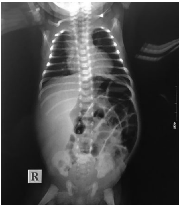
Fig. 2 Preoperative abdominal X-ray.

Twelve hours later, our patient exhibited bilious vomiting and worsening inguinoscrotal edema. Abdominal examination showed signs of generalized rigidity and guarding. With