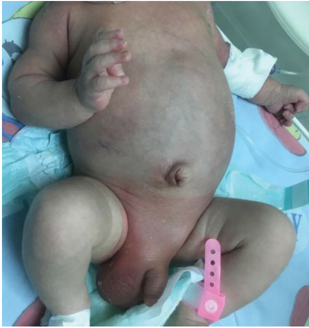
Fig. 1 Neonate presenting with inguinoscrotal erythema and edema.

with Doppler did not show any evidence of incarcerated bowel loops or testicular torsion, although pointing to increased vascularity and echogenicity of the right testis. The patient was, therefore, admitted on the working diagnosis of epididymo-orchitis and started on intravenous antibiotics.