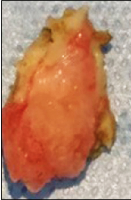
Figure 2. En bloc potassium-titanyl-phosphate laser enucleated specimen.