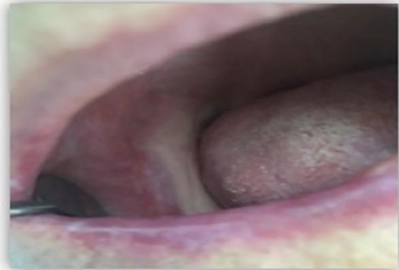
Figure 6: Healed mucosal lesion after third week of therapy with NLB gingival gel

After the third week there were no lesions to detect on the oral mucosa, yet still present slight redness, which completely pulled after the fourth week. Treatment ended after the fifth week when the topical application of the NBF gingival gel was terminated, and therapy was done (Figure 6).