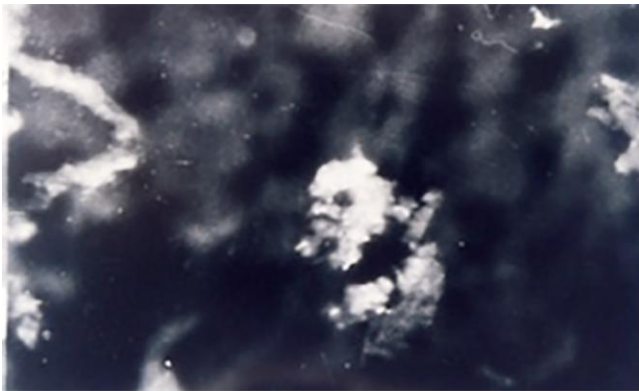
Figure 4: Deposits of immunoglobulin C3 by the length of the epithelial basement membrane and superficial layer of the lamina propria at oral lichen planus

The patient was suggested not to receive food or drinks in the next 20 minutes, and gel to be protected by sterile gauze. Also we administered Nystatin, 4 times per 25 drops orally, due to prevention of candidiasis.