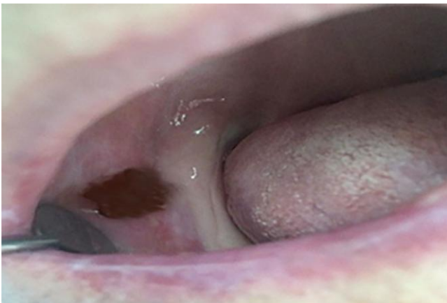
Figure 5: Application of the NBF gingival gel at the site of the buccal mucosae lesion

Systemic application of corticosteroids at this moment was avoided (Figure 5).