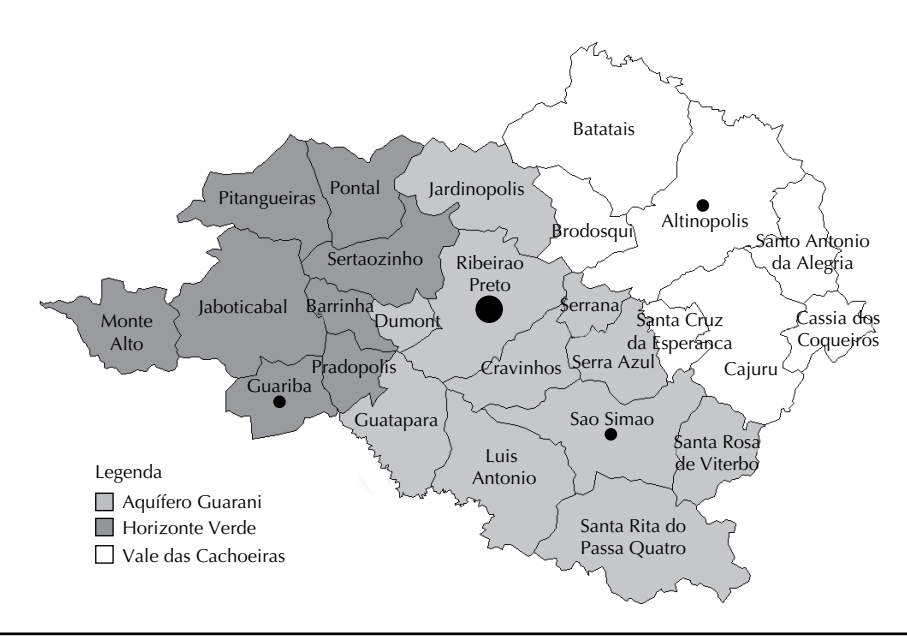
Figure 1. Municipalities in the 13<sup>th</sup> regional department of health of the state of Sao Paulo, according to district. The larger sphere marks the hub municipality and the smaller spheres, the project partner municipalities, showing the strategic location of each district.

at this stage (September 2013 to March 2014), each institution involved in the project contributed in some way, e.g., with the supply of adult diapers or medicines. The regional SAMU were all scheduled and occurred from Monday to Friday during business hours. Staff of the partner hospitals was trained by the referral hospital on care that limited transfers such as tracheostomy management, use of BiPAP and preparation of special diets.