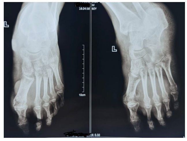
Figure 3. Foot radiograph showing soft tissue mass in left foot.

The complete excisional biopsy was obtained from the nodule in the left foot and fixation was carried out by using formalin solution. Embedding was performed in a paraffin embedding medium in order to carry out the sectioning process. The hematoxylin and eosin-stained sections were then examined. The histopathologic findings revealed a hyperplastic epidermis with some ulcerations (Figure 4a). Cell clusters were present under the epidermis with an irregular and invasive pattern, basaloid pattern (Figure 4b), and squamous-like differentiation (Figure 4c). Ductal differentiation varied from small intracytoplasmic lumens to mature, well-differentiated ducts lined with a thin-eosinophilic layer (Figure 4d). Numerous mitotic activities (>14/HPF) and cytological pleomorphisms were observed (Figure 4e). This pathology report was suggestive for porocarcinoma.