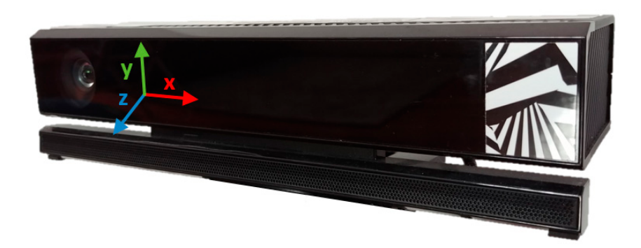
Figure 2. 3-D coordinate system of the Kinect v2, located at the center of the infrared sensor [26].

The 3-D position of the Qualisys' markers was acquired at 200 Hz, with an accuracy of at least 0.6 mm. Data provided by the Kinect—3-D body joint, depth and infrared—were acquired at 30 Hz, using our KiT software application [25]. Each body joint frame includes the 3-D position of the twenty-three joints tracked by Kinect (see [10]). The 3-D coordinate system associated with the Kinect v2 is illustrated in Figure 2. The data from both systems were synchronized, and the time intervals corresponding to walking towards the Kinect were automatically selected, using the methods described in [9].