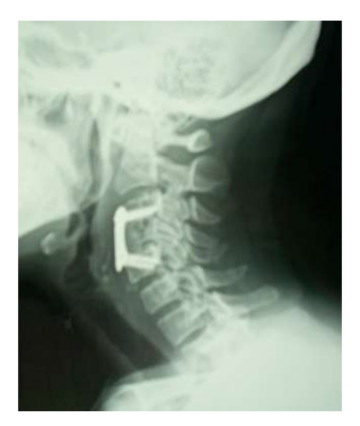
Figure 3: anterior arthrodesis

Figure 2 : magnetic resonance imaging revealed a compression of the C4 body with epiduritis, or spinal epidural abscess, and infiltration of the paravertebral soft tissues, suggesting primarily an infectious origin