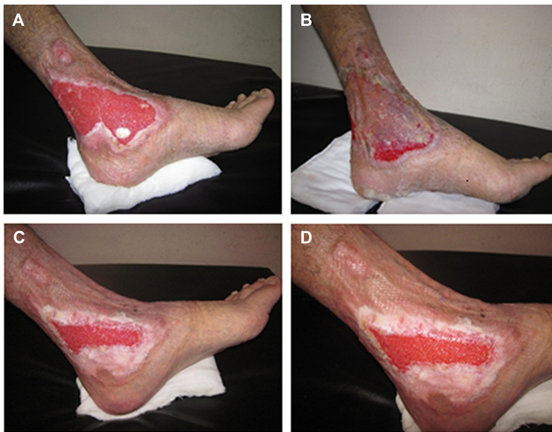
Figure 4 Healing of two leg ulcers after amniotic membrane application.

Notes: Two leg ulcers in one patient (A); application of amniotic membrane on the two ulcers (B); reduction in size of both ulcers (C); complete healing of the upper ulcer and 70% reduction in the size of the lower one on follow up (D).