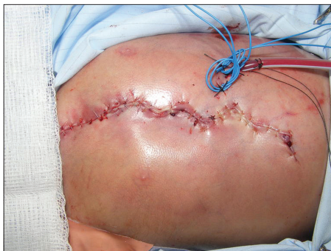
Figure 2 Post-operative view showing burns excised and closed as W-plasty. Drains and pacing wires visible on left side of chest to preserve blood supply to contralateral rectus muscle.

The infant was due to undergo cardiac surgery via a median sternotomy approach later that day. It was felt that the proximity of the burns to the proposed surgical site would carry a significant risk of wound breakdown or mediastinitis from a potentially colonised burn wound. For this reason, the decision was made to excise the burn at the same time as the cardiac procedure.