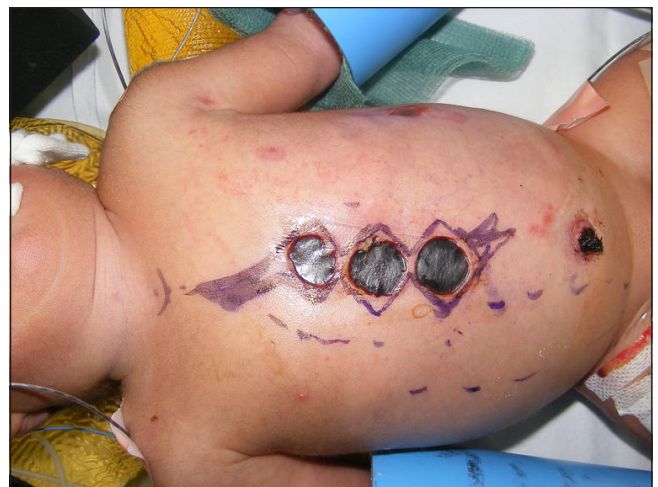
Figure 1 Pre-operative markings showing plan to excise burns as W-plasty, preserving small intact skin bridges

removed temporarily to perform echocardiography after approximately nine hours. At this point it was noted that there were several burns under the pads: three full thickness burns along the left sternal edge as well as a smaller full thickness burn on the left lateral chest wall and a partial thickness burn on the back.