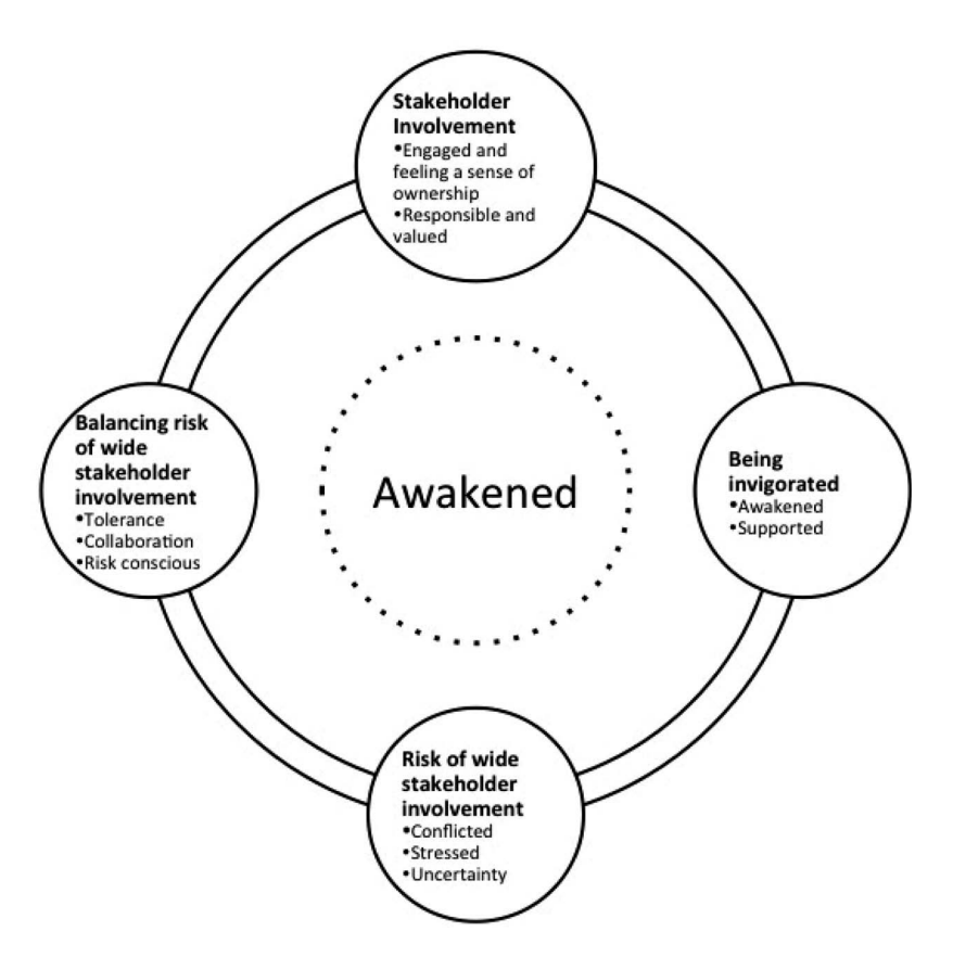
Figure 2. Visual representation of the stakeholder experiences. The stakeholder experiences were found to revolve around being awakened and happened in a sequential manner. Starting with involvement, stakeholders felt invigorated next; this however came with risks of multi-stakeholder involvement, which prompted action to balance the risks.

'I am involved in MANIFEST, for example, I take part in the radio talk shows and MANIFEST provides us with some airtime, where we sensitize our mothers and men. We talked about how they supposed to treat pregnant mothers and on how my