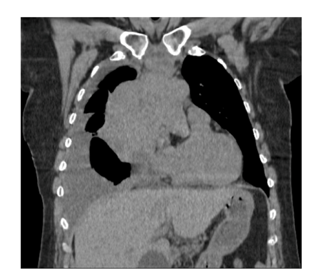
Fig. 1. Patient 1, Chest CT on diagnosis showing mediastinal mass and pleural effusion.

While several organizations have published COVID-19 management guides for patients with cancer during the COVID-19 pandemic, most do not specifically address treatment of patients with positive SARS-CoV-2 PCR [9,10]. Our two cases highlight the possibility of treating select, especially asymptomatic patients with aggressive HM and COVID-19 with standard-of-care chemotherapy, and a potential role for remdesivir in treatment algorithms.