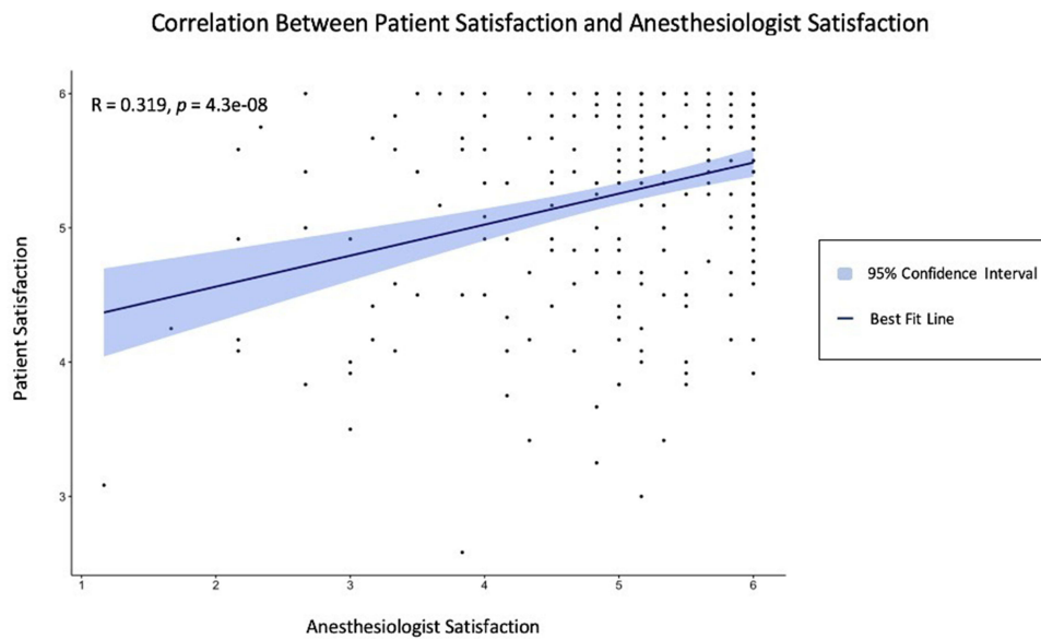
Figure 2 Plot displaying the correlation between patient satisfaction and anesthesia provider satisfaction.

measures, indicating that surgeon and anesthesiologist satisfaction cannot be used to reliably predict patient satisfaction. Moreover, even when individual measures of patient satisfaction, such as pain and anxiety, were isolated, the correlations between provider and patient satisfaction remained low.