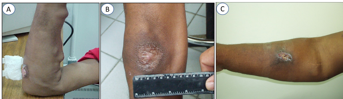
FIGURE 1: Features of lesions in two cases of American cutaneous leishmaniasis in hemodialysis patients with ESRD. (A) Upper limb lesion, 4 cm in diameter. (B) Healed upper limb lesion after six months of treatment. (C) Ulcerated upper limb lesion, 3 cm in diameter.

Patient 2: A 60-year-old male with end-stage renal disease presented at FMT-HVD after a snakebite. He had been on dialysis for five years at the time of initiation of the treatment, and had an ulcerated lesion, which was 3 cm in diameter that erupted 30 days before he attended the leishmaniasis clinic ( Figure 1C ). This patient was treated with pentamidine at a dose of 4 mg/kg (IM) in three series with seven-day intervals. Doses were administered on days D1, D8, and D15. No side effects were reported. In the examinations performed on D14, the levels of creatinine and post-dialysis urea were 11.8 and 69 mg/dL, respectively. Except amylase (122 U/L; normal: 0-95 U/L), complete blood count (CBC), glycemia, GOT, and TGP did not exhibit any alterations. During 2004, the mean levels of creatinine and post-dialysis urea were 12.44 and 64 mg/dL, respectively. These values are considered to be within the usual range for patients undergoing dialysis. After six months of follow-up, the lesions healed completely.