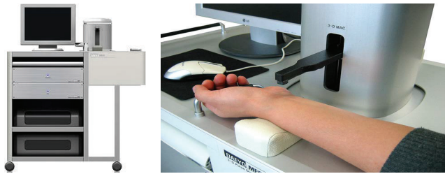
FIGURE 1: 3-Dimensional pulse waveform analyzer (3-D MAC).

BMI: body mass index. MMP: measure of menstrual pain.