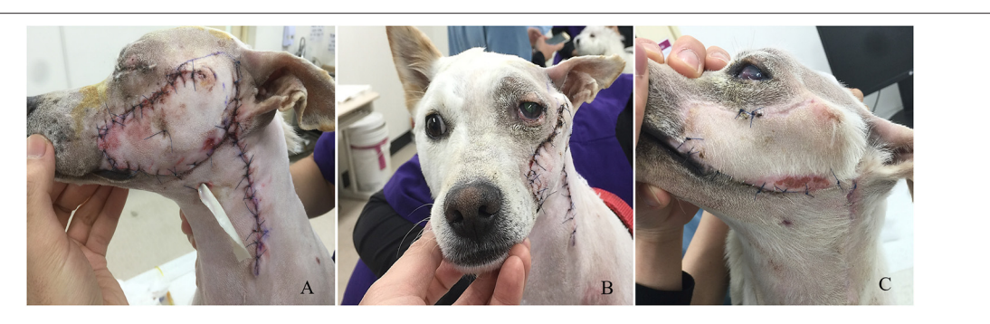
FIGURE 4 | The changes of the flap after surgery. (A) Viability of the flap 1 day after surgery. (B) The conditions of the skin flap and globe 18 days after surgical correction. (C) The condition of the skin flap 21 days after surgery.