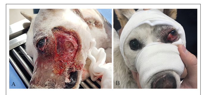
FIGURE 1 | (A) Severe skin defect and necrotic debris. (B) Dorsolateral strabismus before surgical correction.

On physical examination, the dog presented with tachycardia and tachypnea. Other vital signs were unremarkable. Skull radiographs were normal, and no abnormalities were noted involving the dentition. However, along the left lateral maxilla, the external skin and middle part of the sphincter colli profundus pars intermedia muscle were exposed ( Figure 1A ). Ocular examination of the left eye revealed moderate periocular swelling, conjunctival injection, and severe dorsolateral