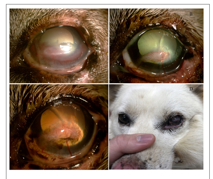
FIGURE 5 | (A) The corneal condition 21 days after surgery. (B) The corneal condition 7 weeks after surgery. (C) The corneal condition 1.5 years after surgery. (D) Globe positions of both eyes 1.5 years after surgery.