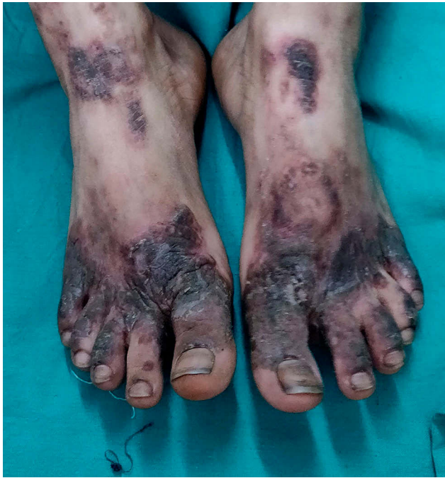
Figure 3 Well developed lesions showing well demarcated thick hyperpigmented plaques with adherent scales.