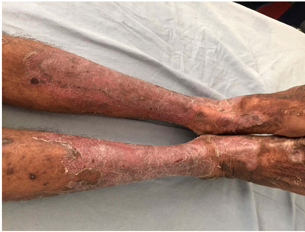
Figure 6 Disappearance of lesions of NAE (refer Figure 5 ) after oral Zinc therapy.