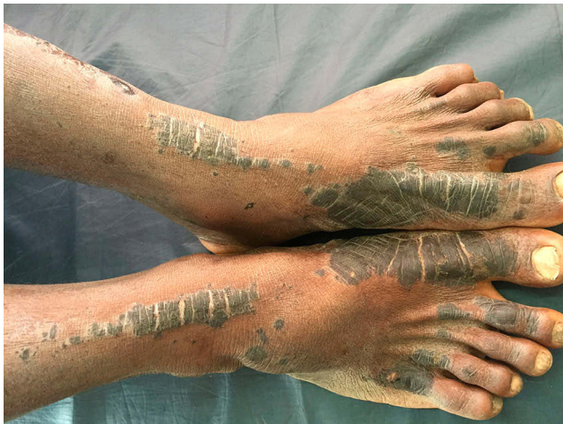
Figure 4 Late lesions showing well demarcated thin hyperpigmented plaques with scaling.

former group is comprised of AE, pellagra, biotin deficiency and fatty acid deficiency. The psoriasis, erythrokeratoderma, nummular eczema, dermatophytosis and paraneoplastic acrokeratosis are included in the latter group. Typical acral distribution and absence of systemic symptoms help in differential diagnosis of acral erythemas. Dark and verrucous scales, well defined lesions and absence of central clearing differentiate NAE from psoriasis, eczemas and dermatophytosis respectively. In some cases histopathological examination is required to