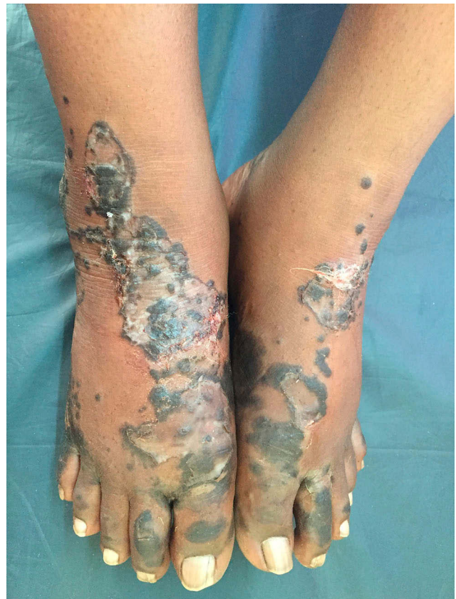
Figure 2 Initial lesions showing well demarcated papules and plaques with dark scales with erosions and edema.

The lesions of NAE evolve in three stages, initial, well developed and late. In the initial stage, scaly erythematous papules/plaques appear with characteristic dusky or eroded centre (Figure 2). In the well-developed stage, the lesions coalesce to form well demarcated thick hyperpigmented plaque with adherent scales (Figure 3). There may be occasional pustules. The lesions become more circumscribed, thin and hyperpigmented in late stage (Figure 4). 17 The lesions typically demonstrate a natural course of spontaneous remission and relapse. 12