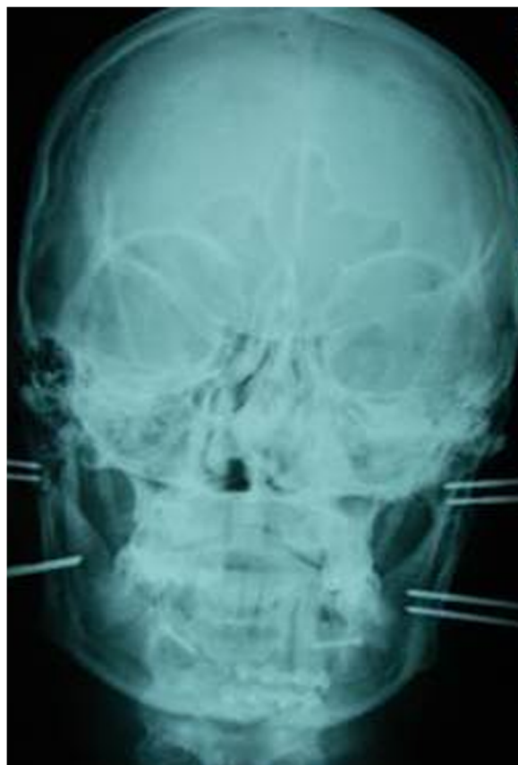
Figure 5 Post surgical CT scan.

these cases, conservative therapy, whilst assuring good dental occlusion in general terms, often does not allow complete recovery of the mandibular movements [15]. Moreover, in the opinion of other authors too, it is difficult to achieve completely satisfactory results from both an aesthetic viewpoint (due to the reduction in height of the ramus) and a gnathological standpoint because of the frequent presence of pre-contact during mandibular movements. Very recently, the direction of the treatment to resolve the greatest possible number of problems linked to fractures of the mandibular condyle, is fast tending towards a surgical approach, thanks not only to new physio-biomechanical acquisitions of the complex temporal-mandibular joint, but also to the development of new surgical techniques such as REFs which allow an optimal adaptation of the fractured fragments without the need for inter-maxillary blockage and the resultant immobilisation of the temporal-mandibular joint. Broadly speaking, the choice of surgical technique is conditioned by various factors such as : the focus of the fracture, the position of the condyle, the time elapsed from the traumatism, the extent of local oedema the type of surgical.