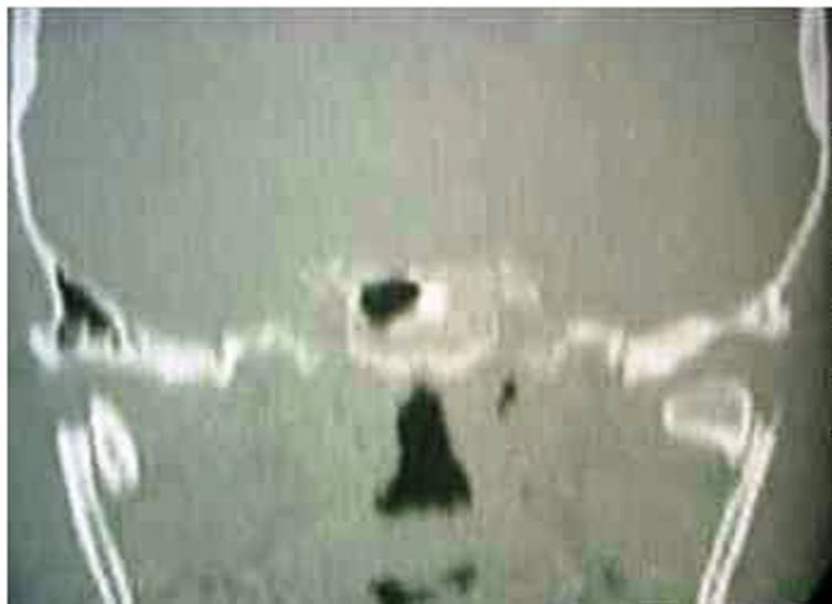
Figure 2 CT scan that indicat surgical treatment.

Also the age of the patient governs the type of therapeutic treatment. During the years of growth some authors have found a greater capacity for morphofunctional recovery of the fractured condyle in comparison with adult patients. Thus the therapeutic approach can vary not only according to the type of fracture, but also the type of patient. The two main therapeutic directions envisage on the one hand orthopaedic-functional treatment and on the other surgical treatment. Orthopaedic-functional therapy remains the most commonly used by various authors, permitting as it does an optimal functional recovery. Here it must be underlined that an intermaxillary blockage determines two main problems; as well