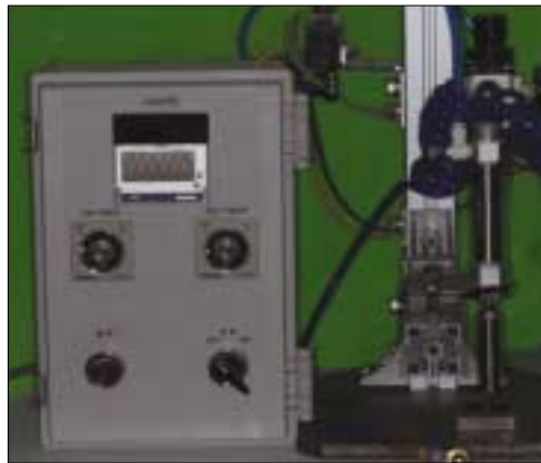
Fig. 2. Loading application instrument.