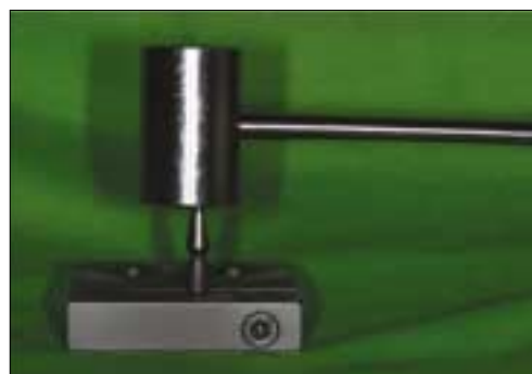
Fig. 4. Tapping with a mallet.