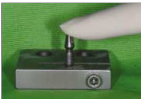
Fig. 3. Application of finger force.