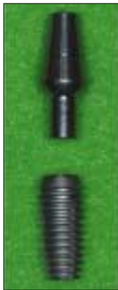
Fig. 1. Fixture and abutment used for this study.

Also Oneway ANOVA on Ranks was conducted to see the differences between two groups fell apart.