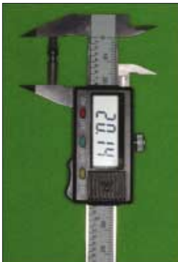
Fig. 6. Absolute Digimatic Caliper® (Mitutoyo, Kawasaki, Japan) for measurement of implant length.