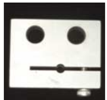
Fig. 5. Jig for implant fixation.