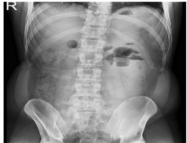
Fig. 1. Native image of the abdomen (standing) – left paraduodenal hernia in a 39-year-old man.

Abdominal ultrasound: the liver is presented in a segmental intercostal