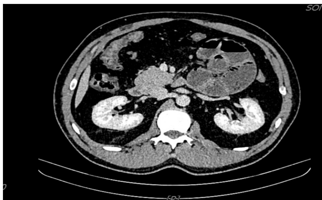
Fig. 2. Axial contrast-enhanced abdominal computed tomography (CT) images of the left paraduodenal hernia in a 39-year-old man.

by drainage and closing of the wound in layers (Figs. 3 and 4). The postoperative course was normal. On the second postoperative day, the patient had a satisfactory local and general status and was transferred from the intensive care unit to the surgical department, with transition to oral nutrition. In the ward, he received oral nutrition with analgesic therapy as needed. On the fifth postoperative day, the patient was discharged with good general and local status. The wound healed primarily and sutures were removed on the eighth postoperative day. The patient was monitored via clinical examinations once a week for the first month after discharge, and then monthly. He was in good clinical condition and did not have any complaints in the clinical interview.