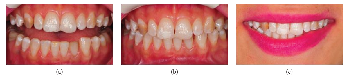
FIGURE 1: (a) Appearance of teeth in the half-open position. (b) Position of teeth in occlusion. (c) Lip position during a smile, smile line, and teeth visibility.