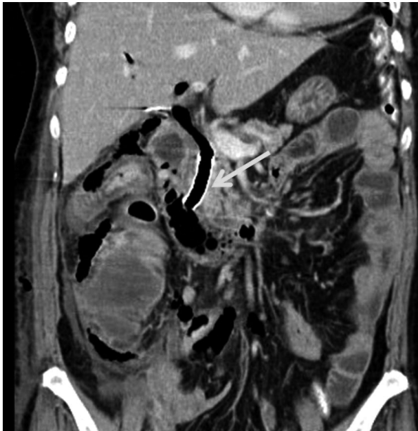
Fig. 4. Abdominal computed tomography scan showing fluid and air collection in the right retroperitoneum. To block further bile and pancreatic juice leakage, a self-expandable stent (arrow) was inserted at the distal common bile duct as conservative treatment.

in the retroperitoneal space should be inspected carefully. Additionally, biliary drainage or pancreatic duct drainage is recommended if possible before the end of the procedure. If perforation is still suspected, then an abdominal CT scan should be performed to determine the location and severity of the fluid or air leakage. If the leakage or the fluid accumulation increases or the patient's condition worsens despite the appropriate conservative management, although associated with a high risk, surgical treatment should be considered.