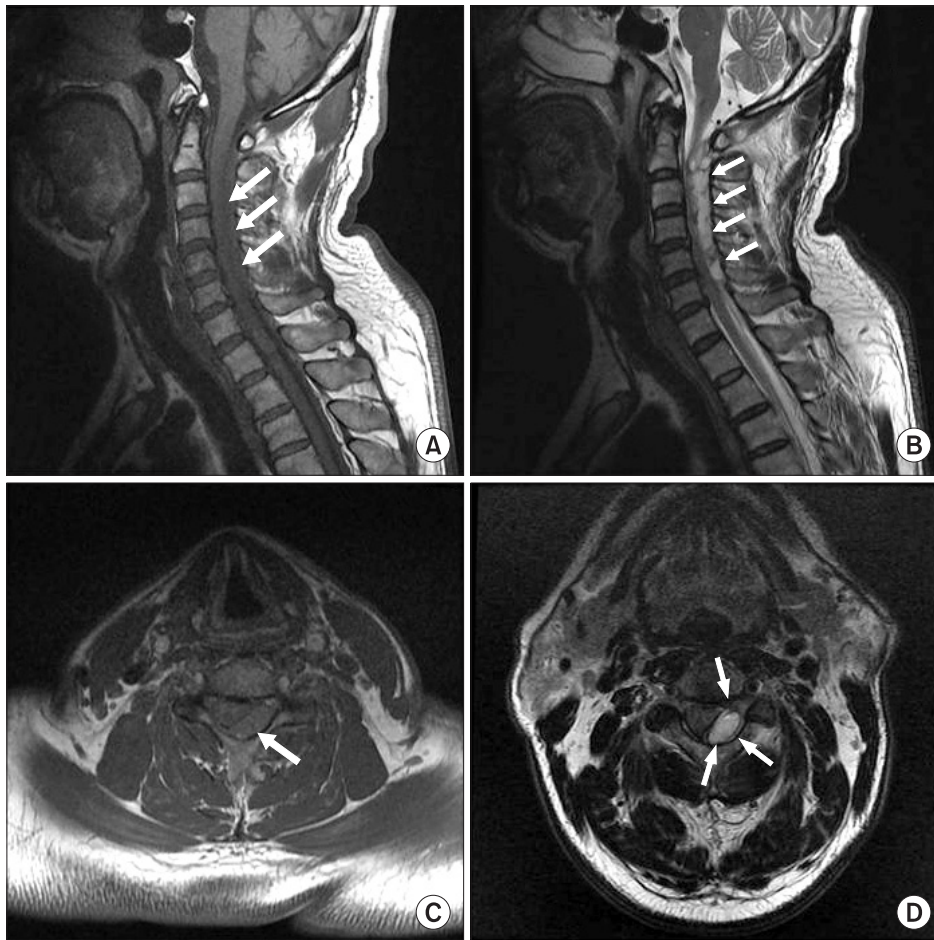
Fig. 1. Magnetic resonance images of cervical spine. (A) T1-weighted sagittal image shows isosignal intensity epidural hematoma and compression of cervical spinal cord (arrows), and (B) T2-weighted sagittal image shows a longitudinal high-signal intensity epidural hematoma extending from C2 to C6 vertebrae (arrows). (C) T1-weighted axial image displays an ovoid isosignal intensity epidural hematoma with compression of the spinal cord (arrow), and (D) T2-weighted axial image displays an ovoid high-signal intensity epidural hematoma in the left posterolateral aspect with spinal cord compression (arrows).

came aggravated. After being transferred to our hospital, diffusion weighted magnetic resonance imaging (MRI) of the brain was performed, which revealed no evidence of acute cerebral infarction. Laboratory findings including complete blood count, coagulation profiles, and biochemistry profiles were unremarkable. A cervical spine MRI was performed for the evaluation of myelopathy and it displayed a longitudinal cervical epidural hematoma extending from the C2 to C6 vertebrae with a compression of the spinal cord (Fig. 1). He underwent left C3 to C5 hemilaminectomy with hematoma removal (Fig. 2). On hematoma evacuation, there was no bleeding or oozing. Two weeks later, he was referred to the rehabilitation unit. At that time, motor examination of the left upper extremity, using the Medical Research Council (MRC) scale, revealed 0/5 elbow flexors, 1/5 wrist extensors, 2/5 elbow extensors, 2/5 finger flexors, and 0/5 finger abductors. Motor examination of the left lower extremity showed 1/5 hip flexors, 4/5 knee extensors, 1/5 ankle dorsiflexors, 1/5 long toe extensors, and 2/5 ankle plantarflexors. On