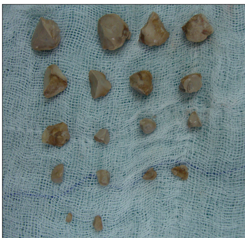
Figure 3: Retrieved 18 stones from the urethral diverticulum

reduces the incidence of post-operative urethra-cutaneous fistula in these patients.