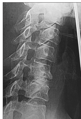
Figure 1: Postoperative (1 month) radiograph lateral view of cervical spine demonstrates bony fusion after anterior cervical discectomy of C5–C6 using porous alumina ceramic cervical cages

The interest of PACC lies in biomaterial micro-porous substitutes which reproduces the trabecular pattern bone. It mimics the porosity of cancellous bone and has approximately the same diameter. The average diameter of cancellous bone is 639 μm, and the average diameter of PACC is 591 μm [Figure 2]. This porous structure allows ingrowth of the bone cells and blood vessels and secondary osteogenesis. [23,24] The material has an open porosity varying from 200 to 600 μm. Medium degree of mechanical strength varies from 20 MPa to 60 MPa. It is also chemically inert. [23,25] In our series, no infection was recognized. Finiels using the same implant in 61 patients reported any complication