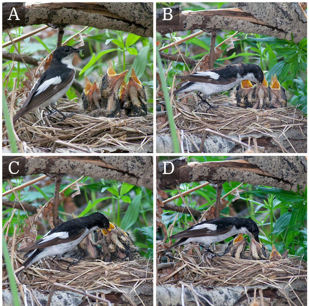
Figure 2 The male of the pied flycatcher ( Ficedula hypoleuca ) feeds the chicks of the redwings ( Turdus iliacus ) despite the fact that he has his own nestlings in the nearby nest-box. The figure parts (A–D) are photos of different visits of the pied flycatcher male with food to the chicks of the redwings and their subsequent feeding.