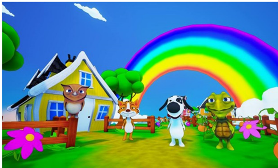
Figure 2 Screenshot of the video game Bubbles© .