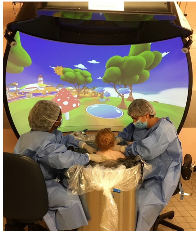
Figure 1 Virtual reality prototype at the hydrotherapy room of CHU Sainte-Justine. Abbreviation: CHU, Centre Hospitalier Universitaire.

The experiment consisted of one session per participant with measures taken at five time periods: 1 hour before the