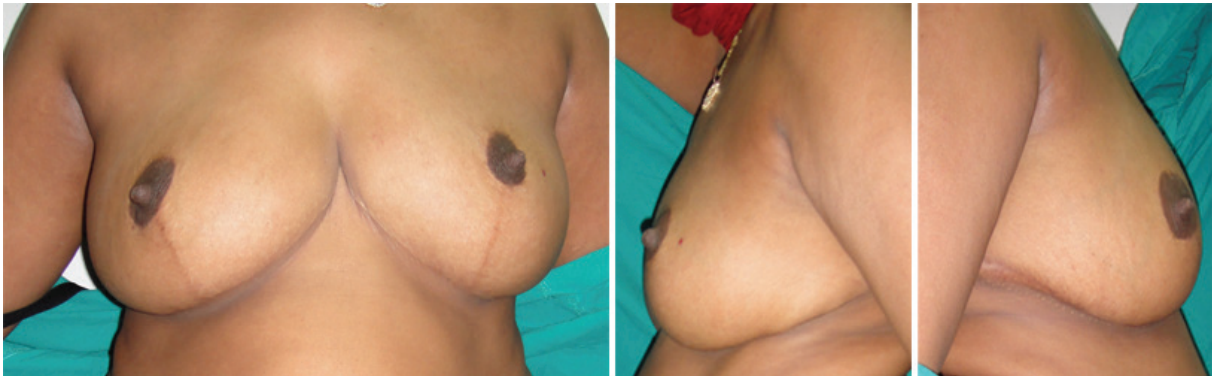
Fig. 1: Late post operative patient who had superomedial pedicle reduction mammoplasty showing good projection and contour of the breasts.