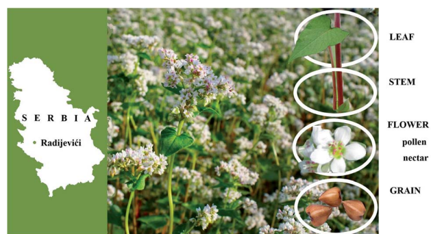
Fig. 1 Buckwheat samples (leaf, stem, flower, grain, pollen, nectar) collected in Serbia, Nova Varoš, Radijevići (43°23'31" N; 19°52'20" E).

All samples were taken from the buckwheat plant ( Fagopyrum esculentum Moench) species ‘Novosadska’ cultivated in a small locality in Western Serbia, in a village Radijevići (43°23'31" N, 19°52'20" E) (Fig. 1). Samples were harvested at the flowering season of buckwheat during the full nectar secretion, in July 2017. Buckwheat plant organs such as leaf, stem, flower, and