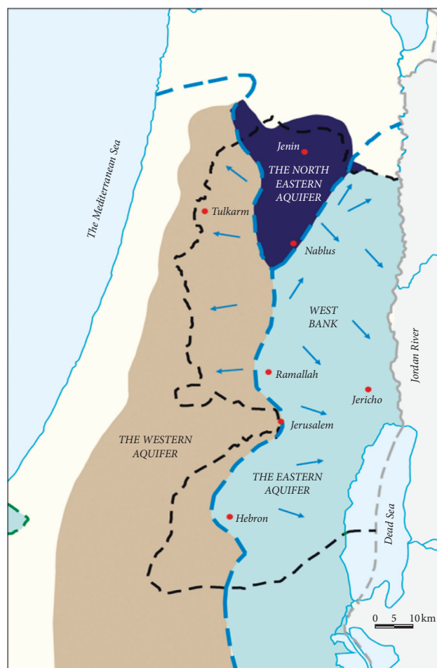
FIGURE 2: The major aquifers in the West Bank [17].