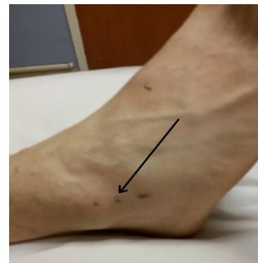
Image. Lateral foot and ankle upon presentation demonstrating puncture wounds (arrow) from a copperhead snakebite without associated local tissue injury.

The patient then told his treating physician that he had also experienced chest tightness, shortness of breath,