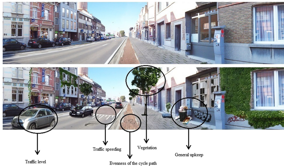
Figure 1 Examples of manipulated photographs from set A with 5 environmental factors manipulated.

path was manipulated by depicting a narrow or wide cycle path.