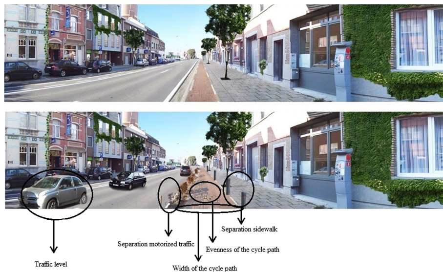
Figure 2 Examples of manipulated photographs from set B with 5 environmental factors manipulated.

During the home visit, the participants were asked to do two similar sorting tasks (one for each set of 32 colored photographs). Before starting the sorting task, the researcher randomly scattered all 32 photographs on a table and read the following standardized instructions out loud: Imagine yourself cycling to a friend’s home located at