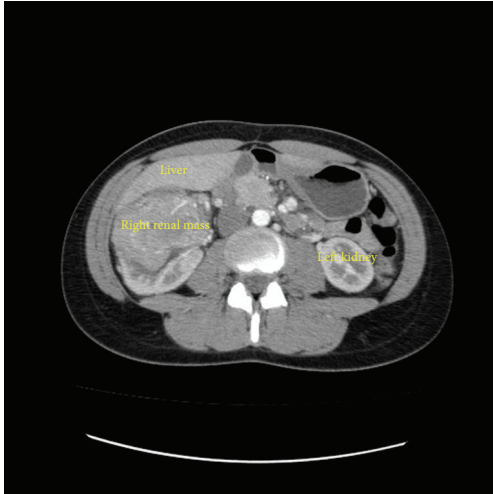
FIGURE 1: Axial images of computed tomography scan showing 9 cm right upper pole mass.