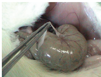
Figure 2 - The appearance of Grade 1 adhesion in Group 2 (Seprafilm group), which developed on the uncovered area on the cecum