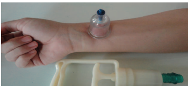
Figure 1. P6 anatomical areas of dry-cupping for postoperative nausea and vomiting (PONV).

Acupuncture stimulation of the point P6 (acupuncture points) has been shown to significantly control nausea and vomiting in a World Health Organization (WHO) study. [13] Moreover, stimulated P6 also has analgesic effects. [14] The location of point P6 point is between the flexor carpi radialis and the palmaris longus muscle tendons, about 2 inches proximal to the distal crease of the wrist (Fig. 1). [15] Stimulation of this point has