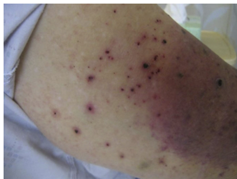
Fig 1. Papules with overlying hemorrhagic crusting located on the proximal arm (underlying bruising is caused by recent trauma to the arm and is not a result of the patient's hemorrhagic bullous dermatosis).

An 82-year-old woman with a medical history of congestive heart failure, myelodysplastic syndrome, thrombocytopenia, and discoid lupus erythematosus was started on warfarin therapy for new-onset atrial flutter. Ten days after initiation of treatment, she presented with a sudden outbreak of painless, nonpruritic, black papules on her extremities (Figs 1 and 2). Given the concern for warfarin-related skin necrosis, she was started on vitamin K and switched to a daily subcutaneous injection of enoxaparin as an alternative anticoagulation treatment. Subsequently, she had epistaxis, which required nasal packing. She was admitted to the hospital 7 days after starting enoxaparin, because of