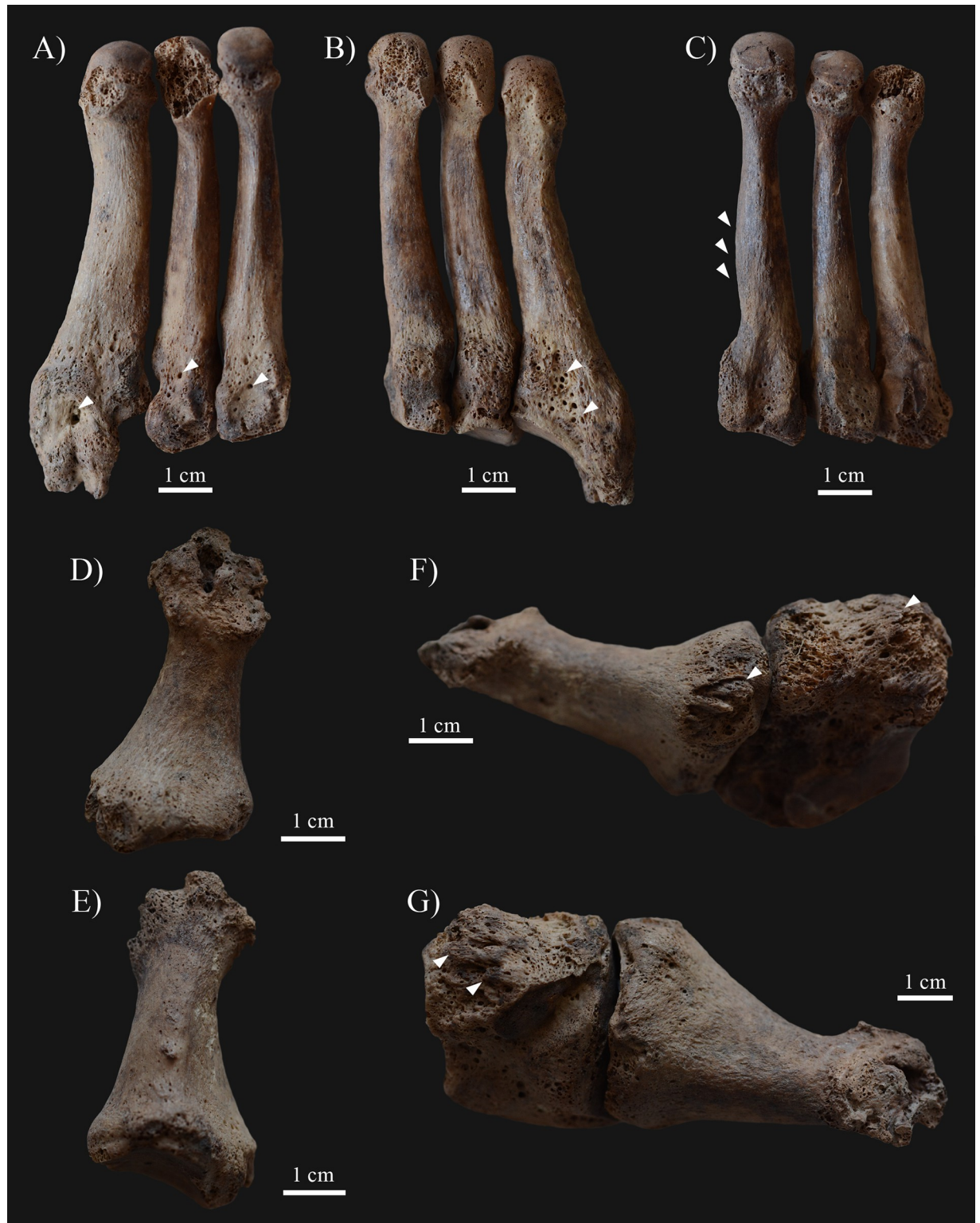
Fig 7. Septic bony changes indicative of sensory peripheral neuropathy in the feet of KK61. Surface pitting and subperiosteal new bone formations on the A) dorsal and B) plantar surfaces of the proximal end of the left 3 rd , 4 th , and 5 th metatarsals (white arrows), with a small sinus on the 5 th metatarsal; C) Slight ballooning of the diaphysis of the right 2 nd metatarsal (white arrows); Almost complete destruction of the distal end of the right 1 st metatarsal—D) plantar and E) dorsal surfaces; and Remodeling of the proximal end of the right 1 st metatarsal and the right medial cuneiform bone with surface pitting and subperiosteal new bone formations (white arrows)—F) right lateral and G) left lateral view.

https://doi.org/10.1371/journal.pone.0269048.g001