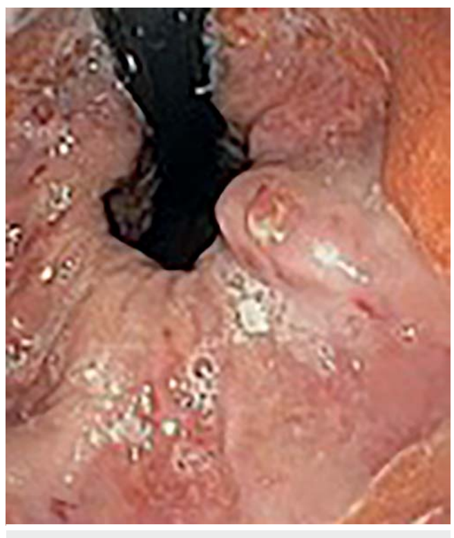
Fig.3 Varices showing white nipple sign at different locations.

before June 2019 when elective intubation was not practiced. Three aspiration events still occurred when elective intubation was practiced as these patients had active spurt between the time when the scope was removed and when intubation was complete. Of the 631 patients in the nipple group, four died within 48 hours post-procedure (0.5%) compared with four of 1970 (0.2%) in the non-nipple group (P=0.088).