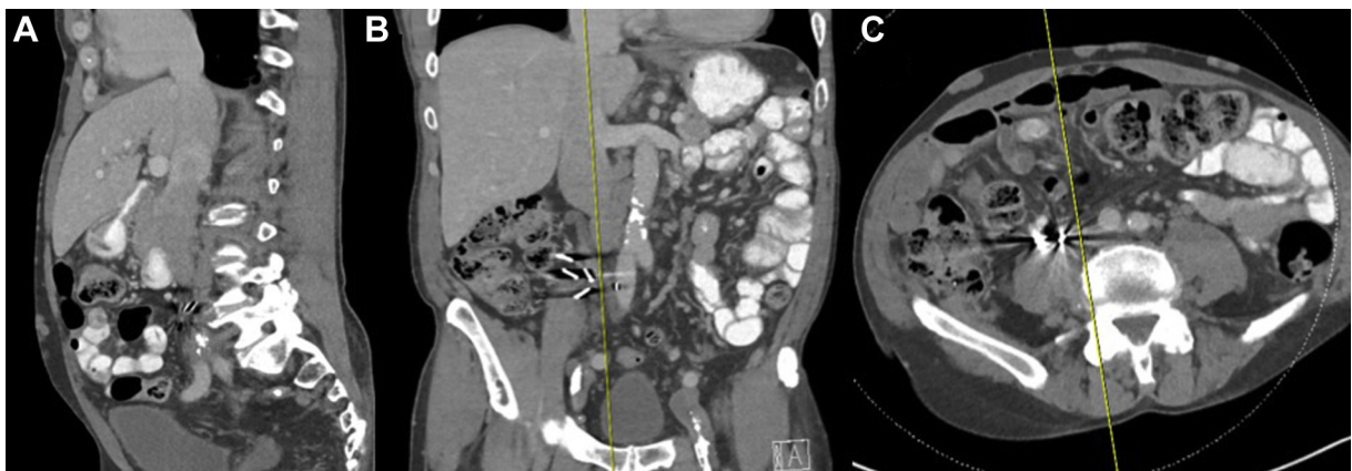
Figure 1 Computed tomography abdominal image in A : sagittal, B : coronal, and C : axial planes showing inferior vena cava ligation clips with chronic calcific thrombosis of the deep veins distal to the ligation and collateral venous channels.

A 3-dimensional electroanatomic map of the left atrium was created on the CARTO 3D system (Biosense Webster) using the PentaRay mapping catheter (Biosense Webster). An irrigated-tip ablation catheter (Thermocool SmartTouch SF Catheter; Biosense Webster) was used to circumferentially isolate the pulmonary veins as 2 common left- and right-sided ostia (Figure 3A and B). Pulmonary vein isolation was confirmed using exit and entrance blocks. The ablation catheter and sheath were then withdrawn into the right atrium to construct a right atrial map on CARTO. The catheter was positioned in the cavotricuspid isthmus region to perform atrial flutter line ablation starting at the tricuspid valve