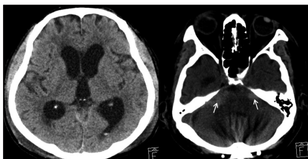
Fig. 3. Brain CT shows marked enlargement of the lateral, third, and fourth ventricles. Also, SAH is observed in the cerebellomedullary cistern (arrows). CT : computed tomography, SAH : subarachnoid hemorrhage.

ment, therefore, extraventricular drainage (EVD) was performed. Two weeks after EVD, ventriculo-peritoneal shunt was performed, however, neurologic deterioration was not fully recovered. Three months after trauma, he eventually died due to heart failure.