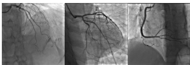
Figure 3. Coronary angiogram after administration of intracoronary nitroglycerin.