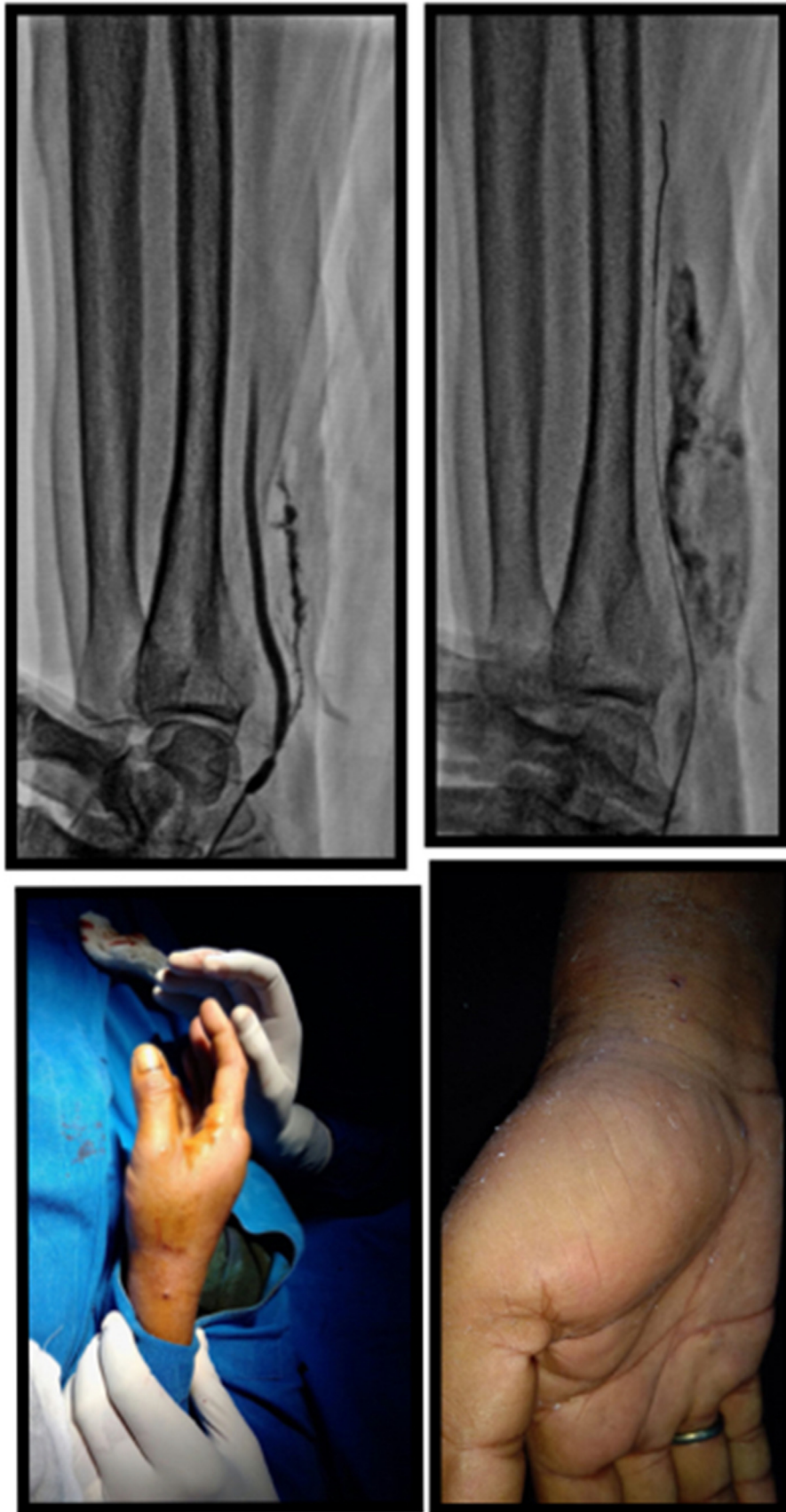
Fig. 4. (A,B) (left to right) Complication of distal right radial access: Hand hematoma following DRRA, localized to hand (A) Dorsal (B) palmar aspect of hand.