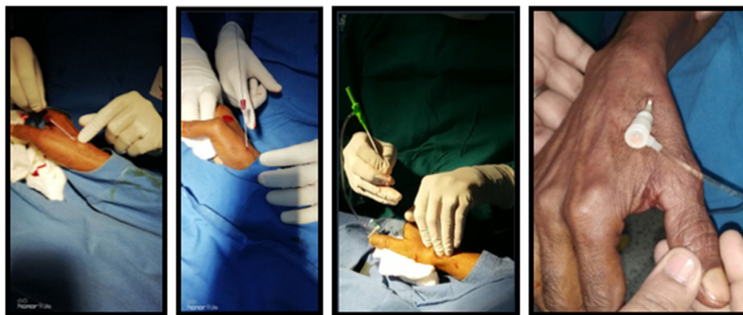
Fig. 2. Hand position for distal radial artery puncture: approximately 30° short of full pronation with <15° extension and variable ulnar flexion at the wrist with the patient's forearm by the side. The extent of wrist extension and ulnar flexion were varied per operator discretion, to optimize palpability of the DRA. Fig. 2(A–D). (Left to Right): Distal radial artery was cannulated in the anatomical snuff. Box which is on dorsal surface of hand formed anteriorly by Abductor Polices Longus and Extensor Polices Brevis, Posteriorly by Extensor Polices Longus, Base by styloid process of radius, Floor by scaphoid and trapezium bones. Fig. 2A: showing puncture of DRA using Jelco canula. Fig. 2B: Sheath wire inserted. Fig. 2C: Sheath inserted over the wire. Fig. 2D: Sheath successfully inserted in the DRA.

Patient demographics including left ventricular ejection fraction and hemodynamic instability; pre-procedural characteristics, palpability of DRA and RA (poorly- or well-palpable), ultrasound data (radial diameter and anomalies), patient anxiety (on a scale of