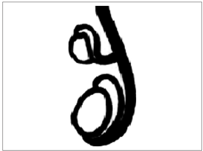
Figure 4: Type-III: The supernumerary testis has its own epididymis and both epididymis of the ipsilateral testes draining into one vas. (Complete transverse division of mesonephros as well as genital ridge)