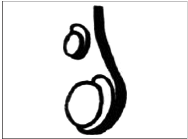
Figure 2: Type-I: Supernumerary testis lacks an epididymis or vas and has got no attachment to the usual testis. (Division of genital ridge only)