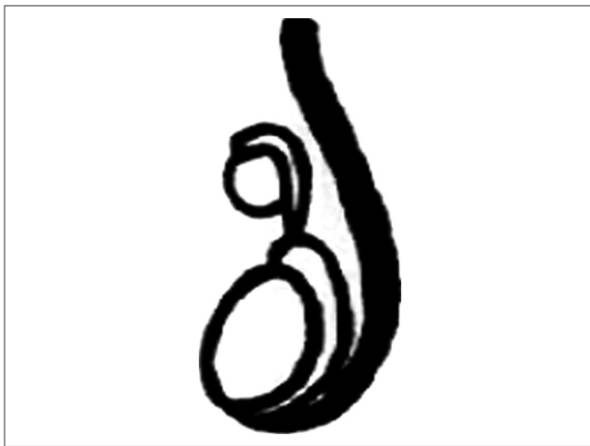
Figure 3: Type-II: The supernumerary testis drains into epididymis of usual testis and they share a common vas. (Division of genital ridge occurs in the region where the primordial gonads are attached to the metanephric ducts, although the mesonephros and metanephric ducts are not divided, i.e., incomplete division)