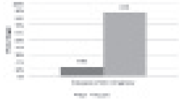
Figure 1 - Prevalence of subclinical hypothyroidism in pregnancy.

Subclinical hypothyroidism in pregnancy has been found to have a significant impact on pregnancy outcomes. Several studies have reported that it is associated with pregnancy complications such as gestational diabetes (GDM), hypertension, and pre-