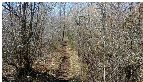
FIGURE 3: Young forest “Les Llongaines.” E(X): 457216/N(Y)4666983.

In the total sample, the within-group analysis (pre-post) revealed a difference score of 3.8 points (SD = 22.9) for the total FIQR, 1.3 points (SD = 8.0) for the subscale of functional disability, -0.9 points (SD = 7.9) for general impact subscale, and -4.2 points (SD = 11.0) for the clinical symptoms subscale, which was statistically significant (32.0 versus 27.7; Wilcoxon Signed Ranks Test Z = -2.04 ; p = 0.41 ). Table 2 presents the scores for individual clinical symptoms, where a significant decrease in the severity of symptoms, such as anxiety (Wilcoxon Signed Ranks Test Z = -2.86 ; p = 0.004 ) and tenderness (Wilcoxon Signed Ranks Test Z = -2.30 ; p = 0.021 ), was observed.