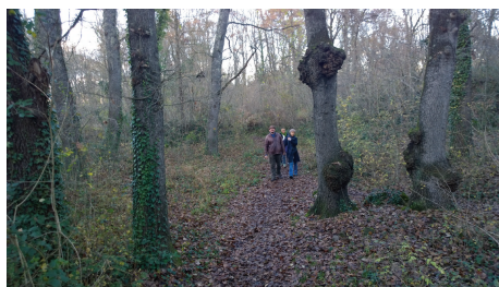
FIGURE 2: Mature forest “Can Serra.” E(X): 457051/N(Y)4667801.