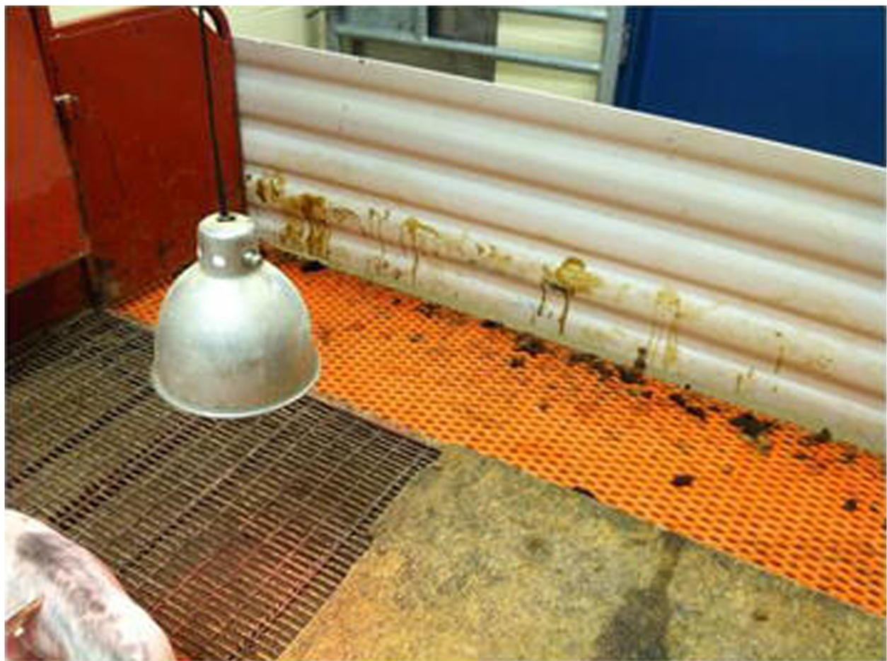
Figure 2 Diarrhea in the treatment group pen. This figure illustrates fecal staining on the wall of the pen housing the Treatment group piglets. This image was taken on day 6 post-ingestion of PEDV-positive feed.

For select samples, it was planned to conduct nucleic acid sequencing of the PEDV S1 gene. Specifically, fragments of the S1 domain of the spike gene were amplified from extracted RNA. Primers 1: (5'- ATGARGTCTTT AAYTACTTCTGG-3'), 2: (5'-CATCCTCACCWGCA CTAGTAAC-3'), 3: (5'- GTTGTGCTATGCAATATGT TTAY-3'), 4: (5'-TGAAATTAATTGTGACAGCATC-3'), 5: (5' -TTGTCATCACCAAGTAYGGTG -3'), 6: (5'- CT AAAAGACAGGTAATCATTAACAG- 3'), 7: (5'- CTG TGTTGACACTAGACAATTTAC- 3'), 8: (5'- CATACT AAAGTTGGTGGGAATAC- 3') were designed to anneal to conserved genomic regions. Incorporation of degenerate bases maximizes the ability of the PCR to amplify genetically divergent PEDV variants between the US and UK strains. Primer pair 1 and 2 obtained a PCR product size of 670 bp, primer pair 3 and 4 obtained a PCR product size of 678 bp, primer pair 5 and 6 obtained a PCR