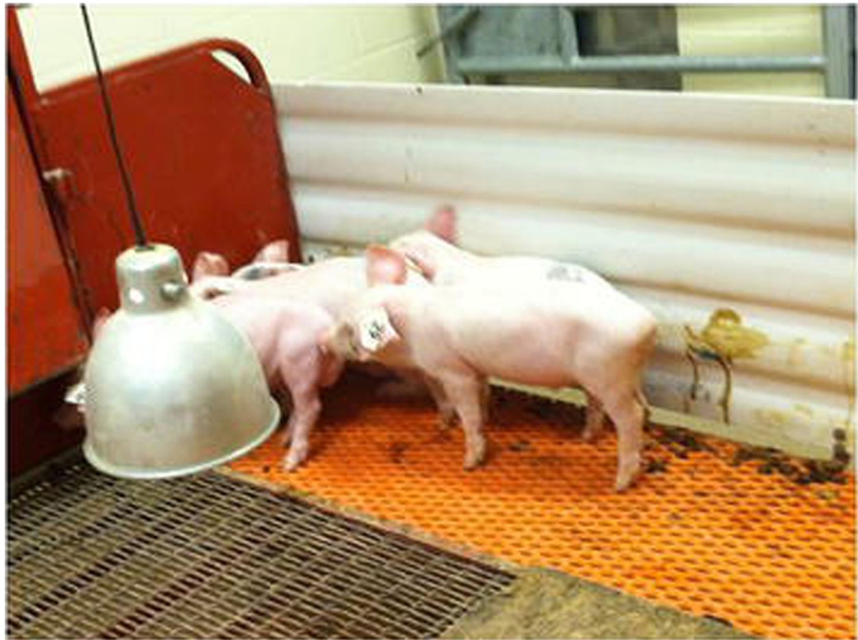
Figure 1 PED in treatment group. Depicted in this figure are clinically affected piglets from the Treatment group on day 6 post-ingestion of PEDV-contaminated feed. Piglets demonstrated loss of condition, rough hair coats, along with clinical signs of PED (diarrhea and vomiting). Evidence of diarrhea is visible on the pen wall behind the pigs. Prior to necropsy, rectal swabs from all 5 piglets were PEDV-positive as detected by PCR.

* = 2 pigs detected as positive on rectal swabs.