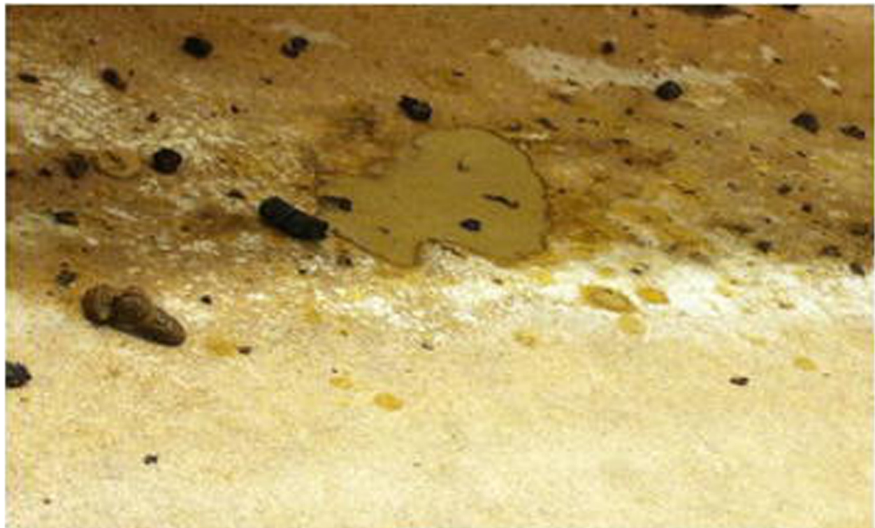
Figure 3 Diarrhea on floor below the positive control group pen. Following ingestion of feed spiked with stock PEDV, piglets in the Positive control group developed clinical signs of PED 2 days post-ingestion. This photo illustrates watery diarrhea observed below the pen floor housing these piglets.

The in vivo phase of the study was conducted from January 17–24 and results are summarized in Table 2. Prior to initiation of the in vivo phase of the study, all