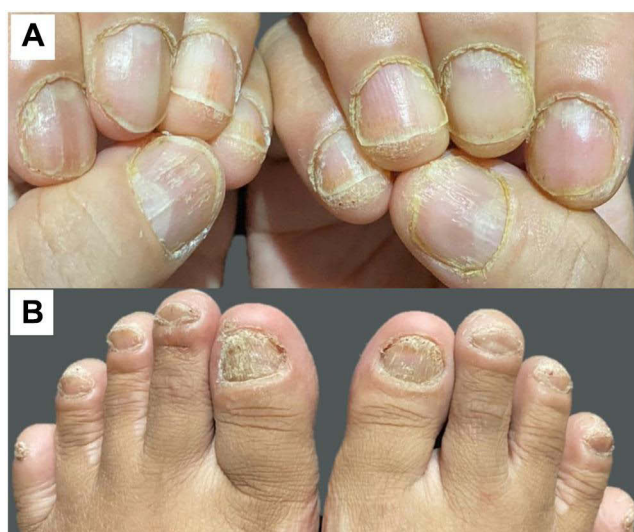
Figure 2 One month after 2nd procedure. Note the improvement of fingernails of hands (A) and feet (B).

Patient was diagnosed as TND caused by LP and treated with topical mixture of 0.1% tacrolimus cream, 20% urea cream, and 20% salicylic acid, applied twice daily and combined with fractional CO 2 laser. We also gave 10 mg desloratadine orally once daily. The fractional CO 2 laser treatment was performed at five weeks intervals without any anesthesia beforehand. Two passes of the laser treatment with pulse energy: 160 mJ, pulse duration: 8.0 ms, density level: 17, depth level: 2, square shape, and array pattern was done over the nail plate until the pixelated frosted area was seen. There was no immediate bleeding or oozing after treatment. Clinical improvement on all nails was seen after two sessions of fractional CO 2 laser treatment (Figure 2). The laser procedures were well tolerated. The patient did not feel pain during the procedure and no adverse effects were reported.