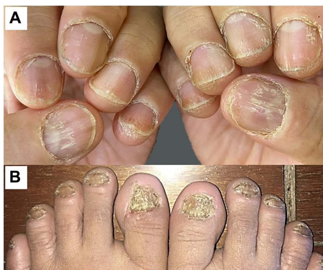
Figure 1 Fingernails of hands (A) and feet (B) before combination therapy.