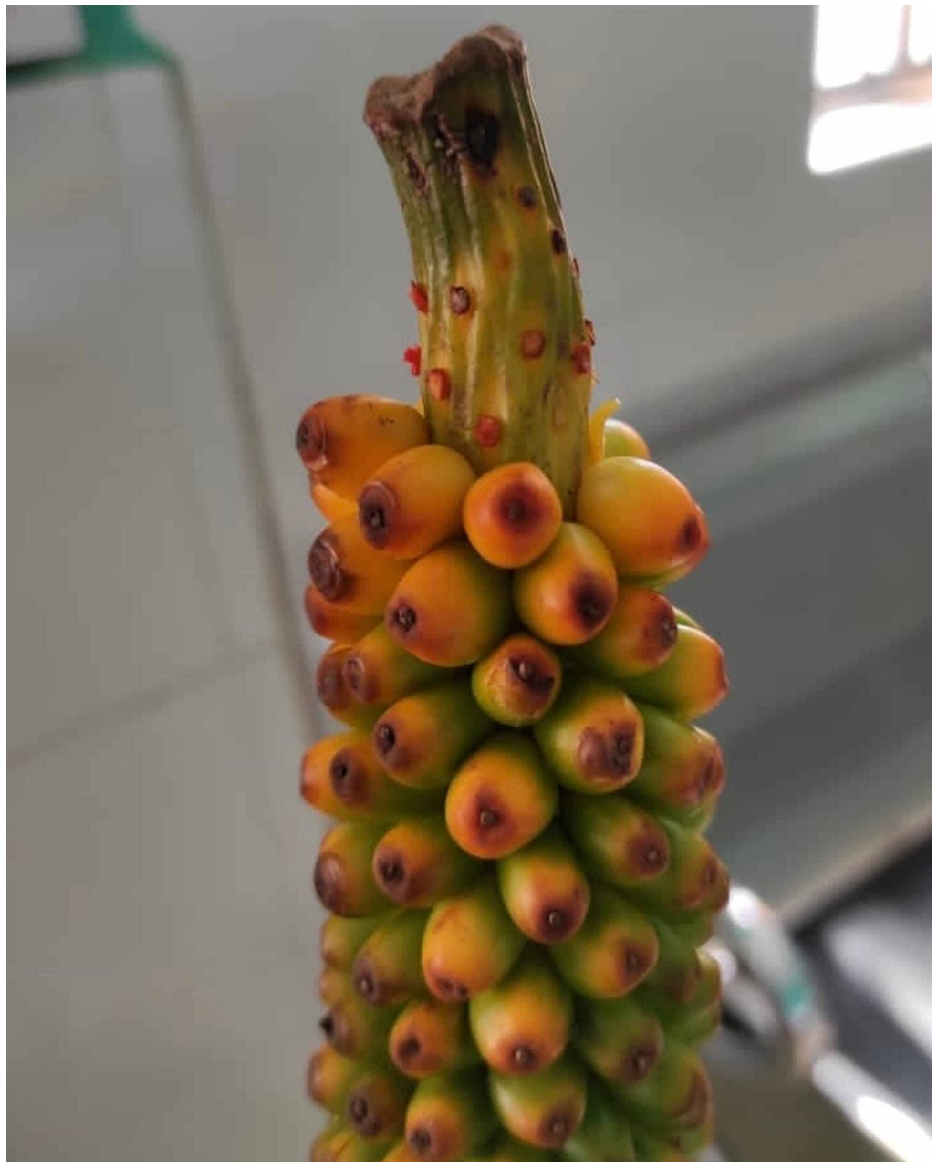
FIGURE 1: Amorphophallus konjac seeds