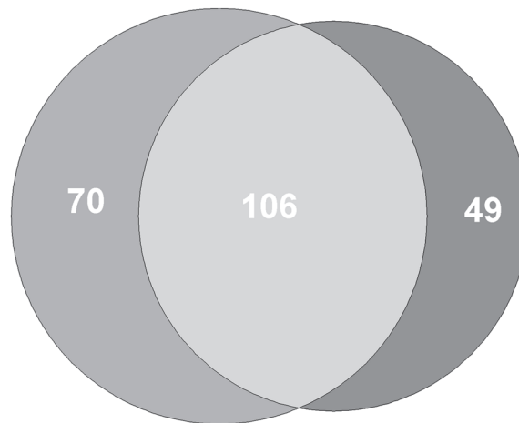
Figure 2 Venn diagram of significantly deregulated miRNAs prior and after chemotherapy. Venn diagram of miRNAs significantly deregulated in Wilms tumor patients prior and after chemotherapy compared to normal controls. There is an overlap of 106 miRNAs that are significantly deregulated in both groups. The overlap consists of 43 miRNAs that are in both comparisons down-regulated, and of 63 miRNAs that are in both comparisons upregulated.

cluster, also known as oncomir-1, is a miRNA polycistron that contains some of the most potent oncogenic miRNAs. The oncogenic effect of oncomir-1 was not only found in kidney cancer [30,31] but also in a broad spectrum of other malignancies including e.g. colon [32], bladder [33] or gastrointestinal cancer [34]. miR-126 a known angiogenic miRNA allowed differentiation between papillary RCC and ccRCC [35]. miR-126 has also been proposed to separate conventional from papillary renal tumors [36]. Increased levels of miR-224 have been found in ccRCCs [37].