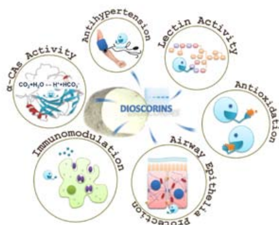
Figure 2. Summary of biological activity of dioscorins