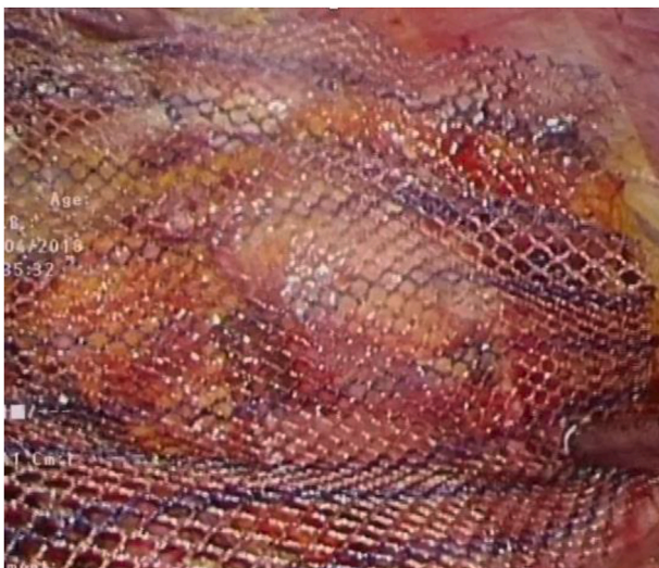
Fig. 1. Laparoscopic view of fixating a mesh in hernia repair.

On the other hand, several techniques were developed as primary and revisional surgery. Single-anastomosis duodeno-ileal switch