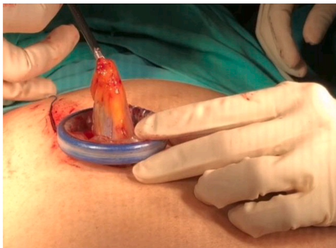
Fig. 4. Retrieving the gall bladder from SILS cholecystectomy.

Before the 1980s, surgeons performed local excision (LE) of distal rectal tumors through a posterior parasacral incision, transsphincteric,